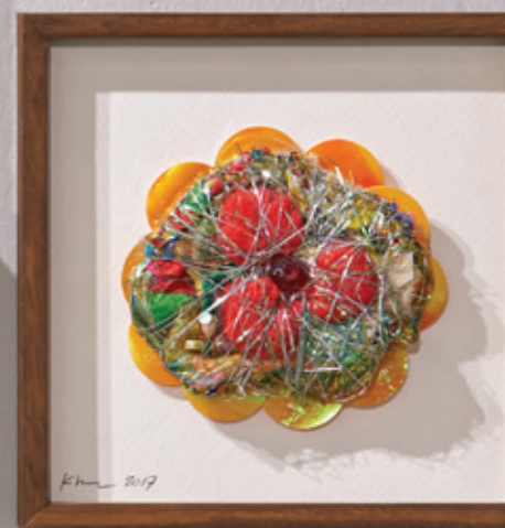
Evolution, 2017 Fabric and Mixed Media Unframed 10 x 10 cm Framed 16.5 x 16 cm