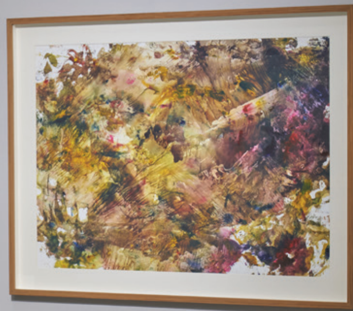
Imprints 6, 2011 Colored Ink on Paper Unframed 70 x 100 cm Framed 86 x 117 cm