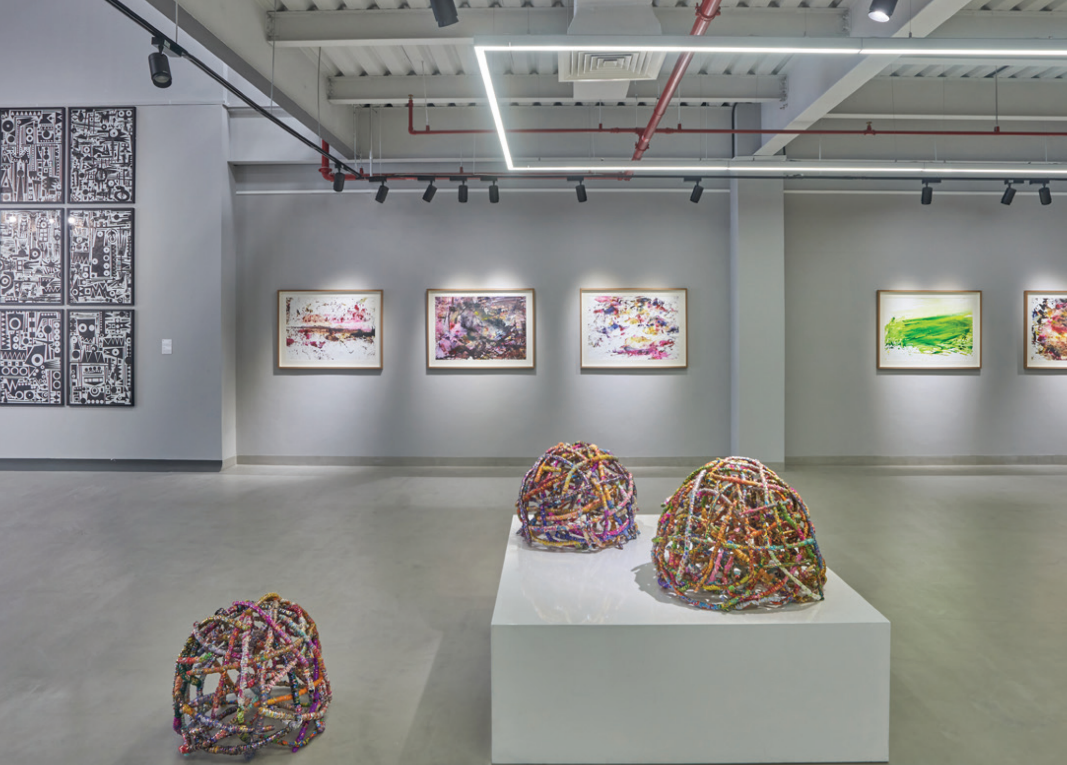
Installation View at Aisha AlAbbar Art Gallery, Dubai, 2021