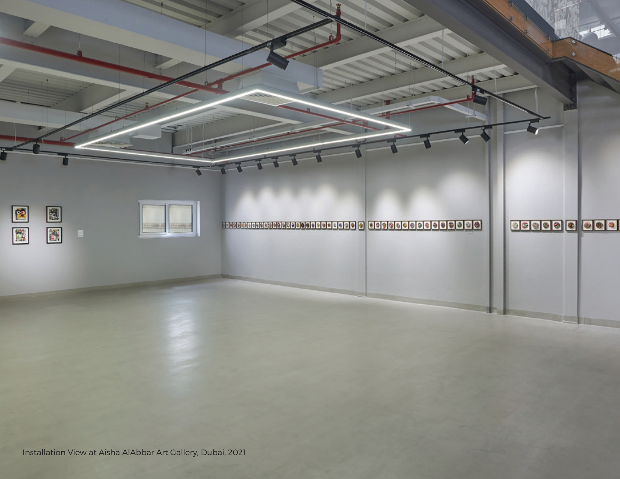
Installation View at Aisha AlAbbar Art Gallery, Dubai, 2021