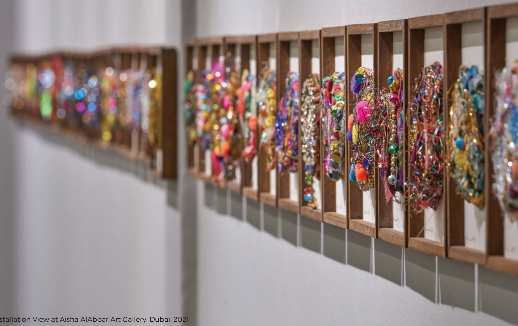
Installation View at Aisha AlAbbar Art Gallery, Dubai, 2021