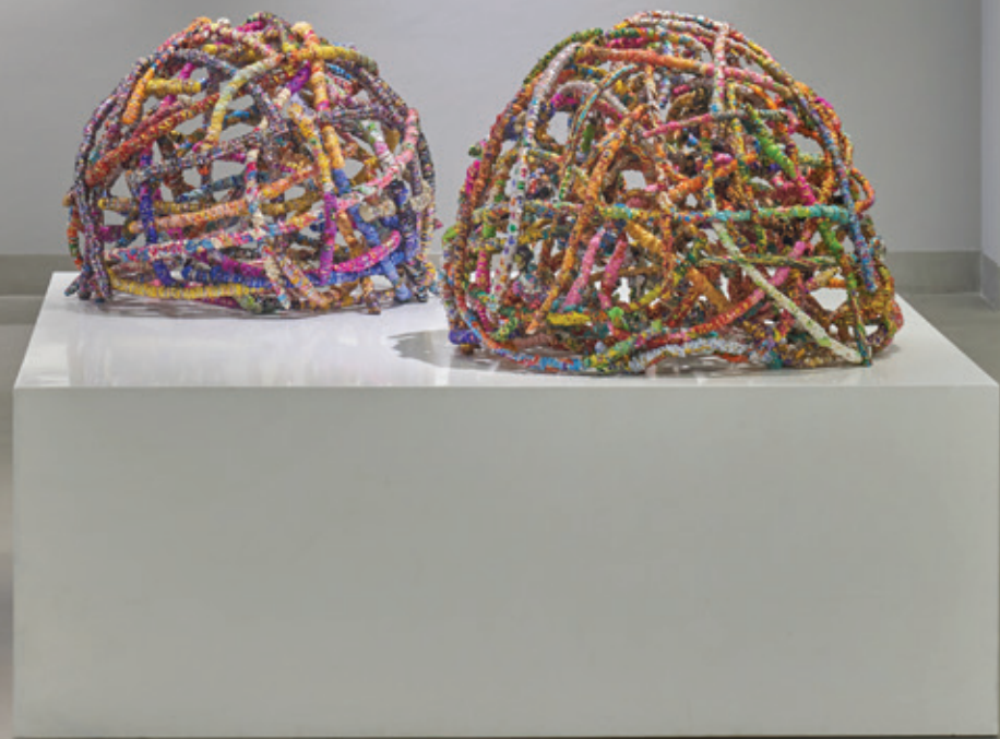
Installation View at Aisha AlAbbar Art Gallery, Dubai, 2021