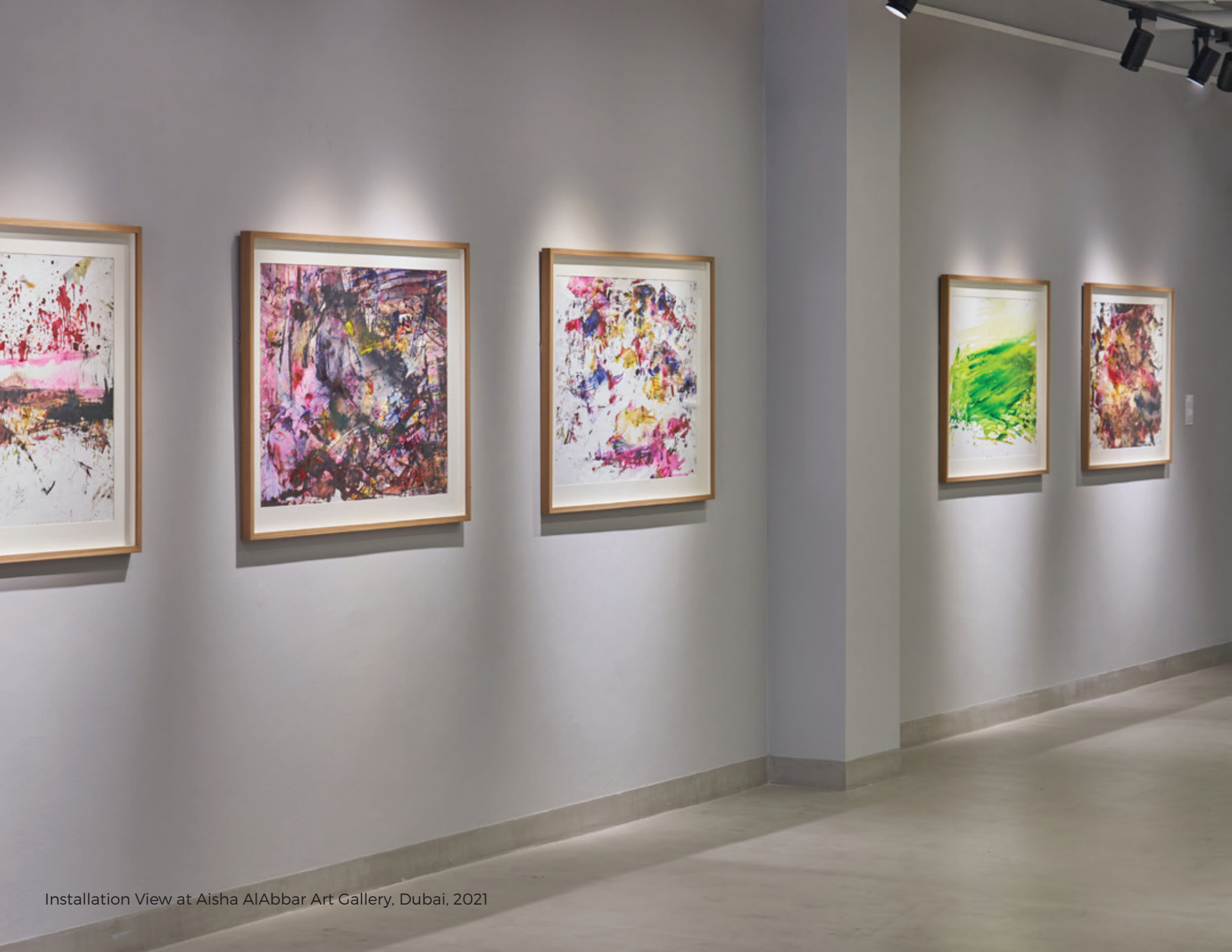
Installation View at Aisha AlAbbar Art Gallery, Dubai, 2021