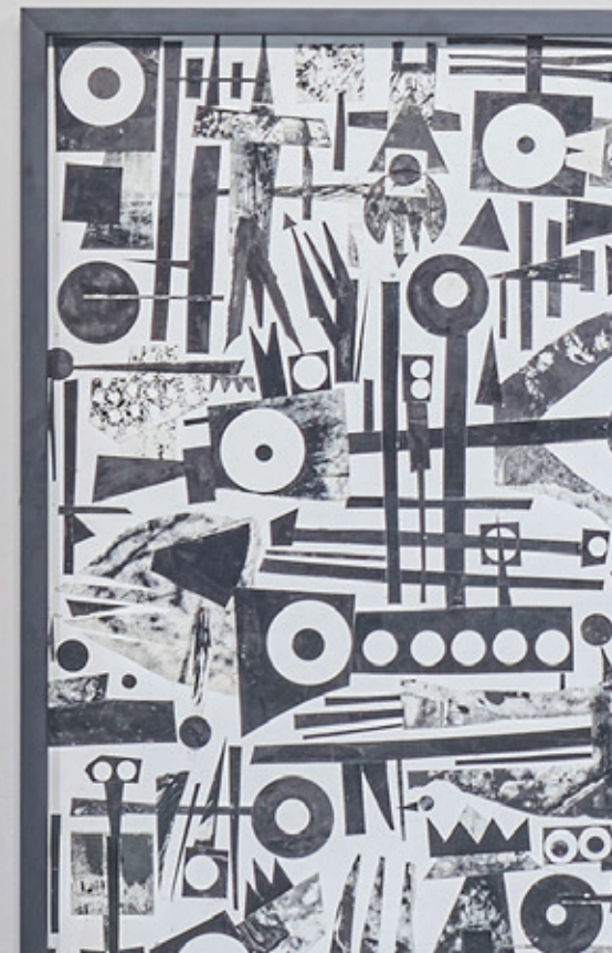
Intersections, (detail), 2020