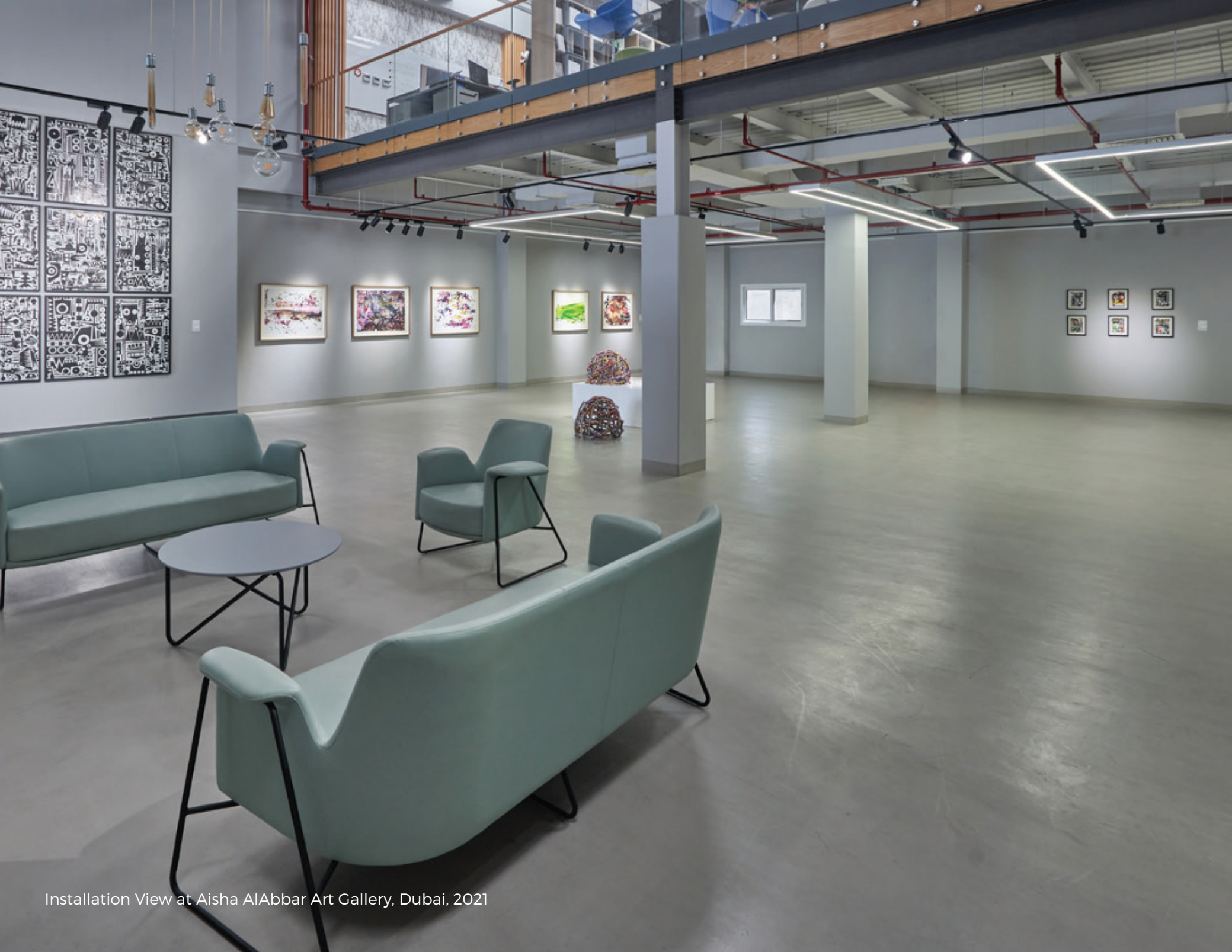
Installation View at Aisha AlAbbar Art Gallery, Dubai, 2021