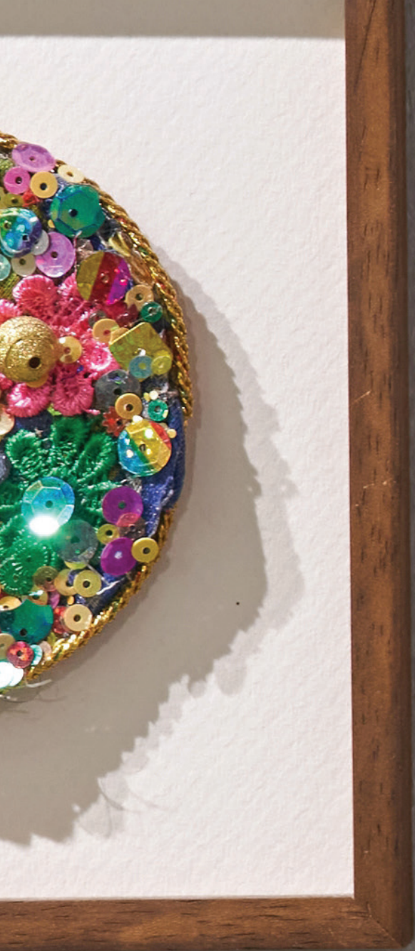
Evolution, (detail), 2017