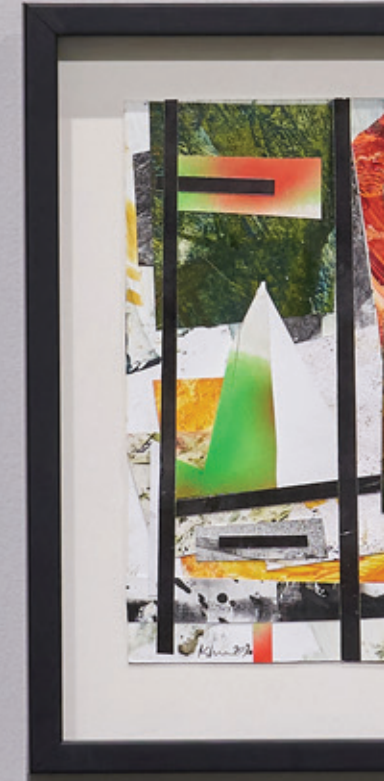
Intersection Color, (detail), 2020