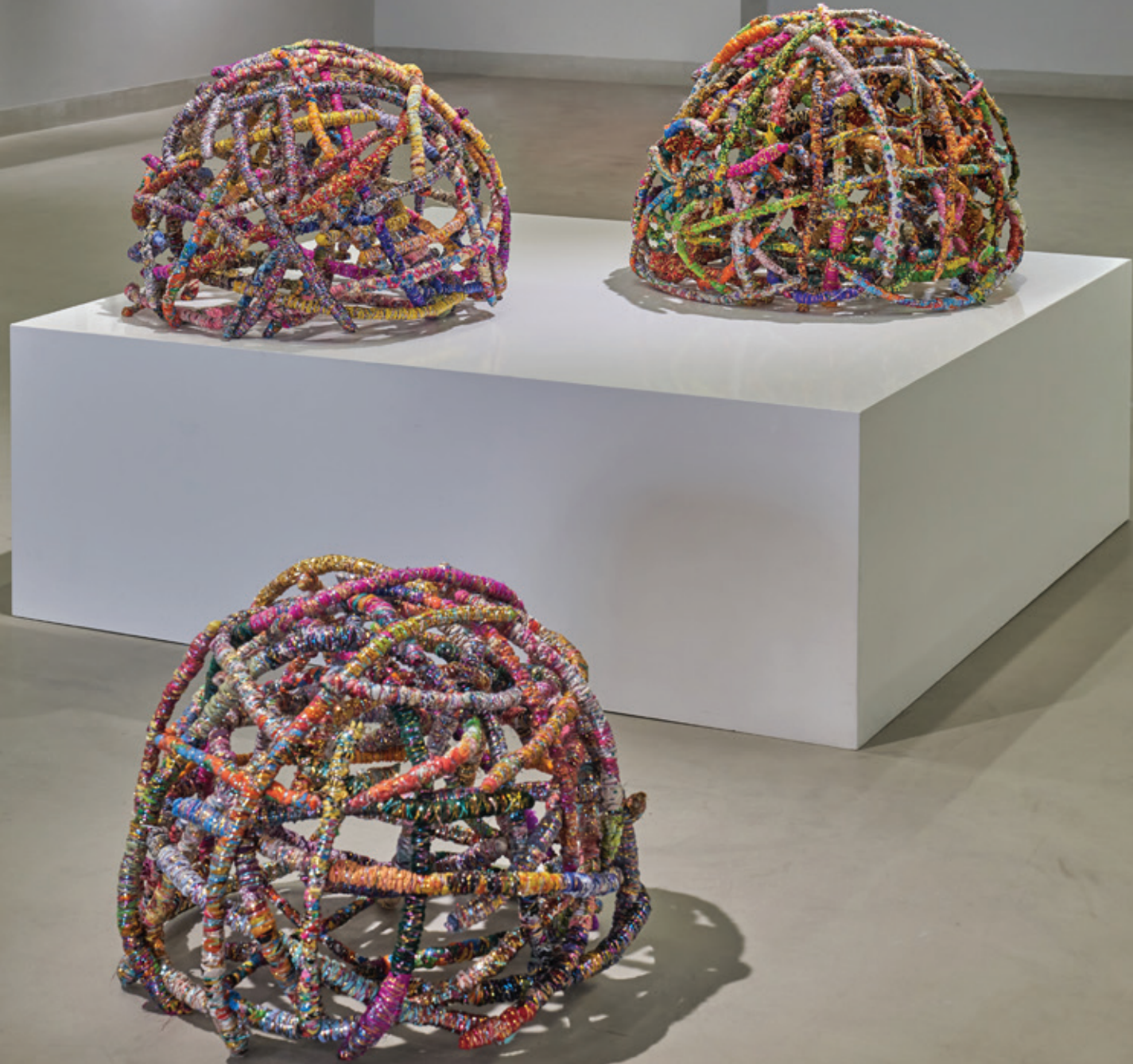
Gargour, 2020-2021 Steel and Fabric Various Dimensions