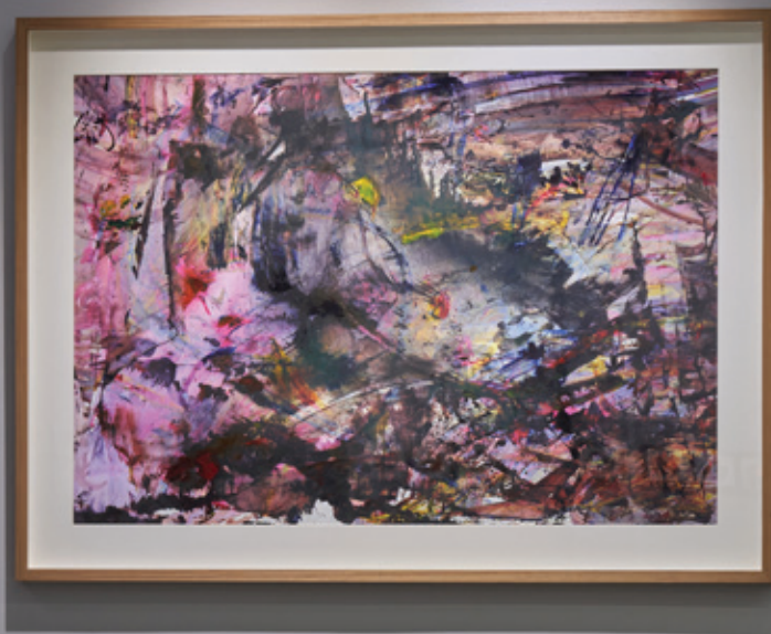
Imprints 3, 2011 Colored Ink on Paper Unframed 70 x 100 cm Framed 86 x 117 cm